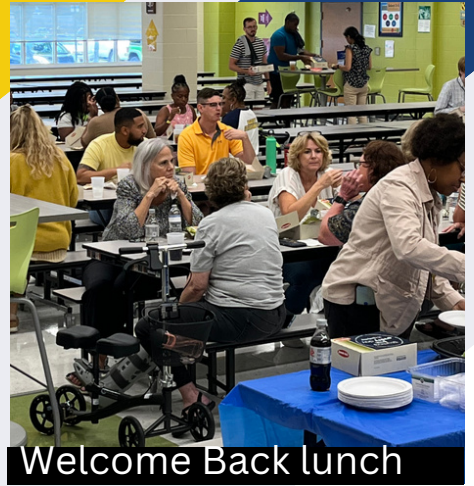
Welcome Back lunch