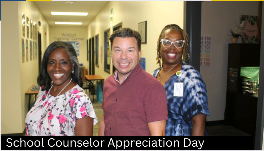
School Counselor Appreciation Day