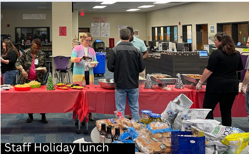
Staff Holiday lunch