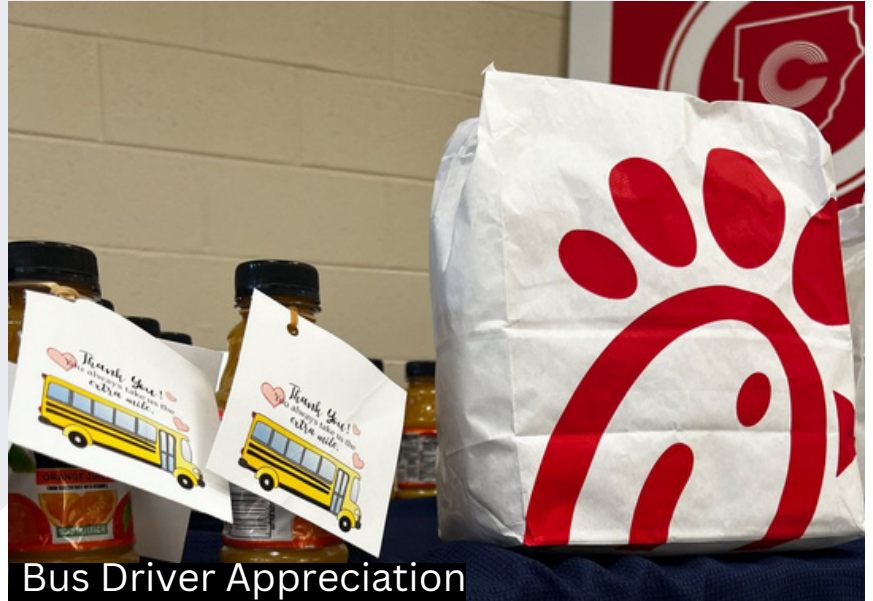
Bus Driver Appreciation