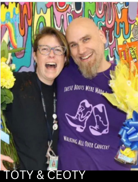
TOTY & CEOTY